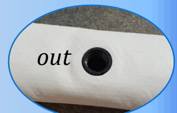
Integral 1/2" female threaded