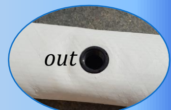
Integral 1/2" female threaded