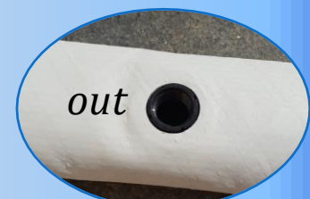
Integral 1/2" female threaded